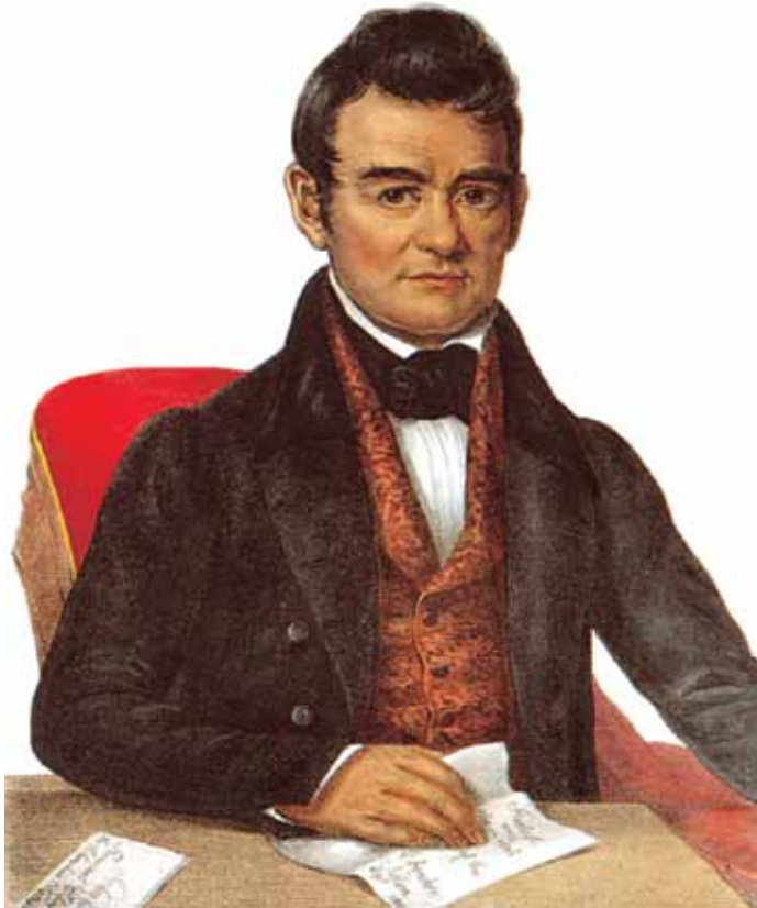
John Ross Cherokee chief

What was the Trail of Tears? The Cherokees were the first to give the western journey a name: The Trail Where They Cried, later shortened to the Trail of Tears. Eventually, this name came to refer to all the removals of the five southeastern tribes because of their sufferings