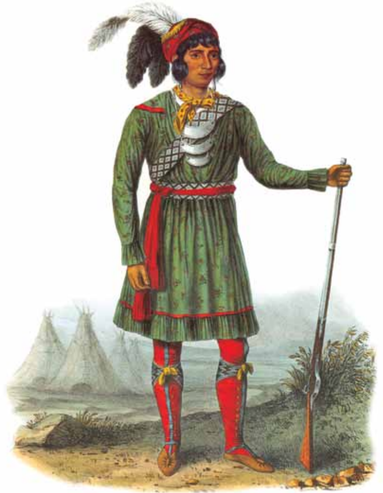
Osceola, the most celebrated character in the Indian Wars of Florida.

Osceola became more powerful and more opposed to removal. He and Thompson became dire enemies. While Thompson arranged for removal, Osceola and the Seminoles made plans to remain. In Decem-